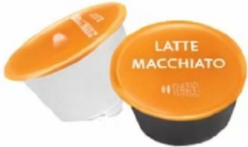
NESCAFÉ® Dolce Gusto® compatible capsules