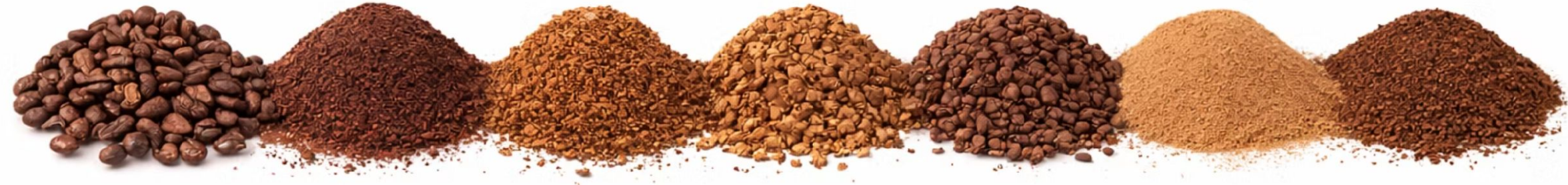
Roasted whole beans